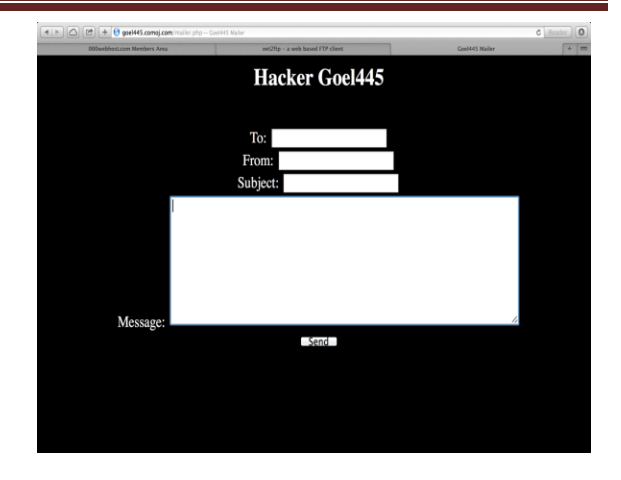
Fig: 6. Social Engineering