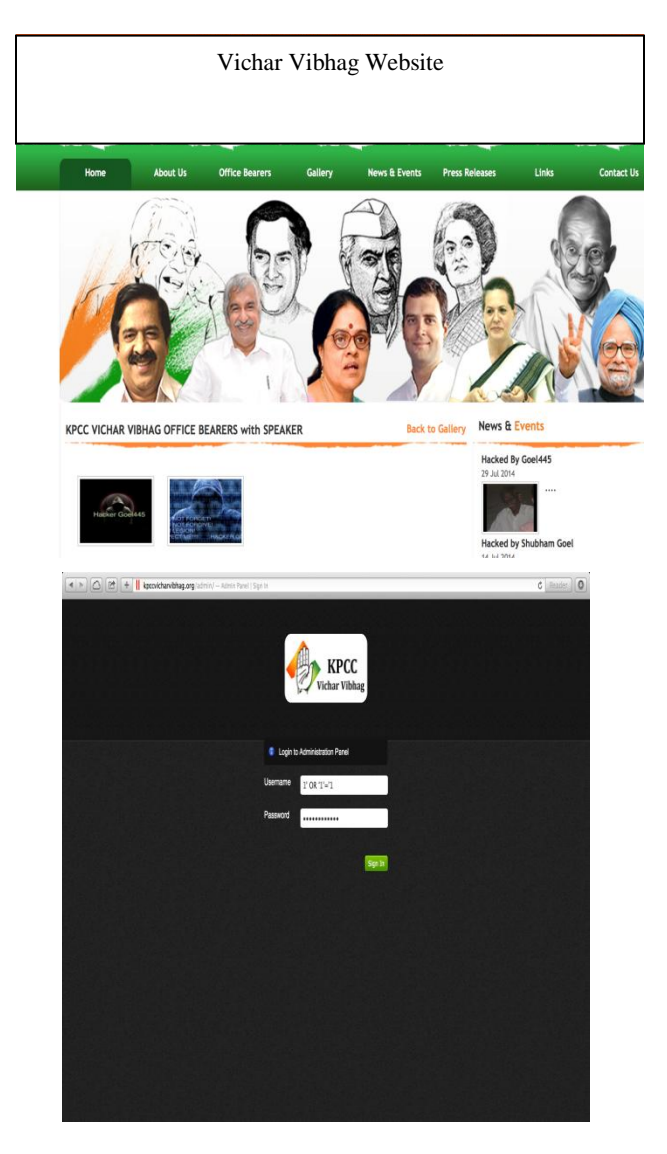
Fig: 2. KPCC Admin Panel Hacking View

A site of its major wing 'VicharVibhag' www.kpccvicharvibhag.org' despite being a site of amajor political party of the world's largest democracy was identified with various vulnerabilities by the authors of this paper.