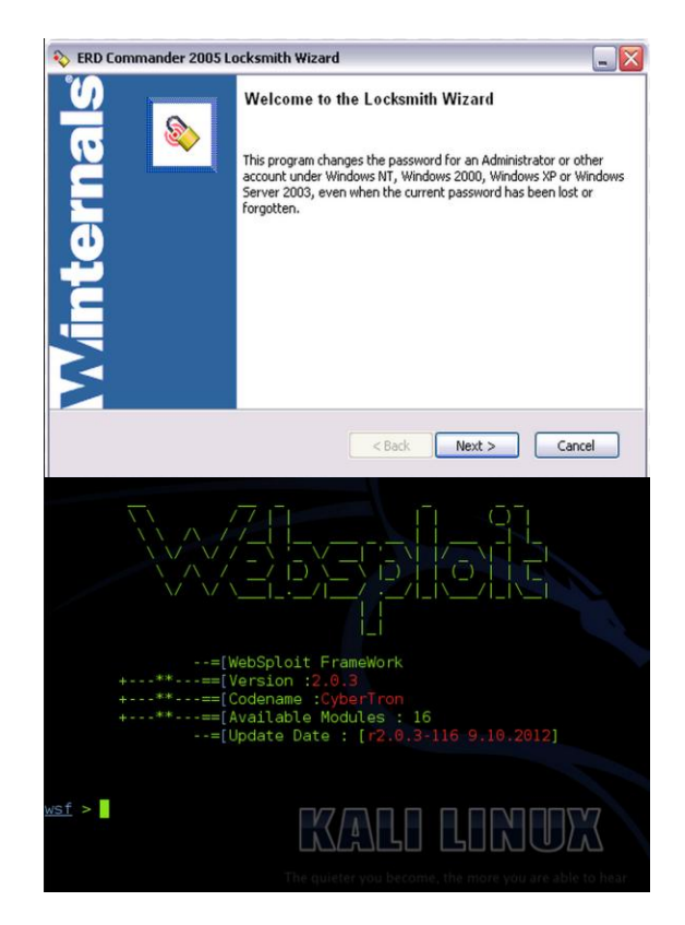
Fig: 5. Emergency Rescue Disk

Hence running ERD and using password recovery will automatically crack password.